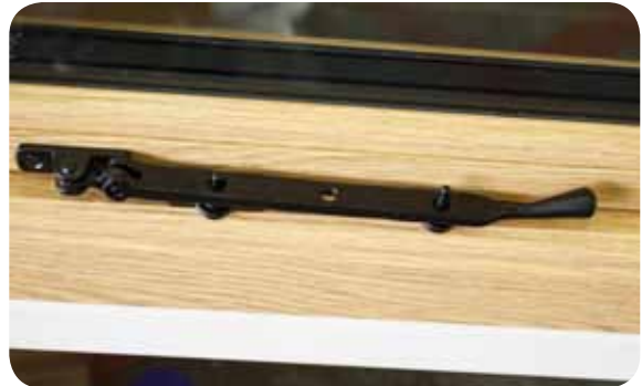
PEAR DROP BLACK