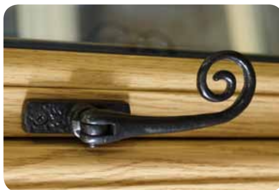
MONKEY TAIL BLACK