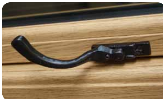
PEAR DROP BLACK