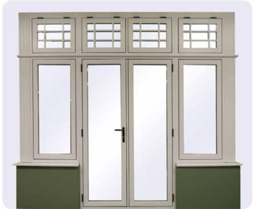
Residence 9 single or double doors Open out full height glazing only

When double doors are specified, the slave leaf is fitted with a concealed single lever lock. This operates shootbolt locking top and bottom.