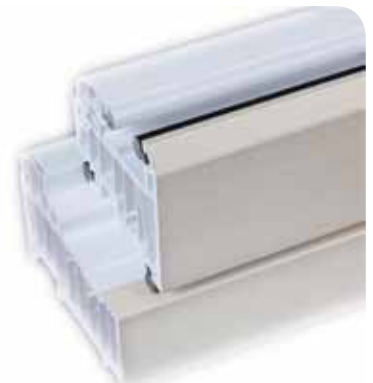
DUAL COLOUR PROFILE