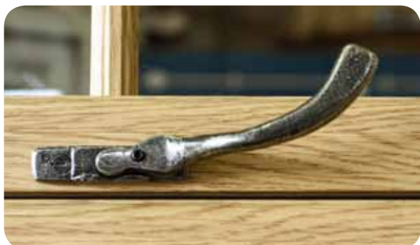
PEAR DROP PEWTER PATINA