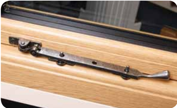
PEAR DROP PEWTER PATINA