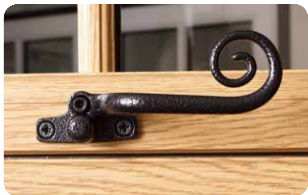
MONKEY TAIL ANTIQUE BLACK