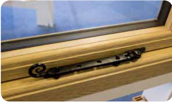
MONKEY TAIL BLACK

Available as a functional stay or as a dummy stay complete with a peg that holds the stay to the sash when the window is opened or closed. These are supplied loose for fitting on site