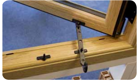
MONKEY TAIL BLACK